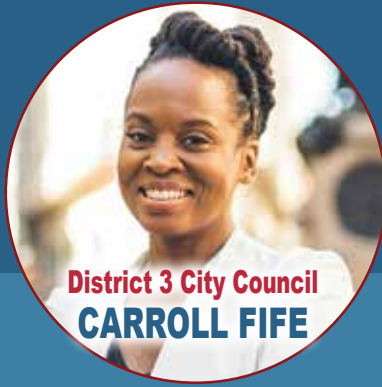
District 3 City Council CARROLL FIFE

VOTE EARLY by OCTOBER 15TH For Game Changing Leaders & Policies